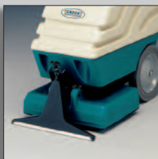
Suction width of 41 or 51cm